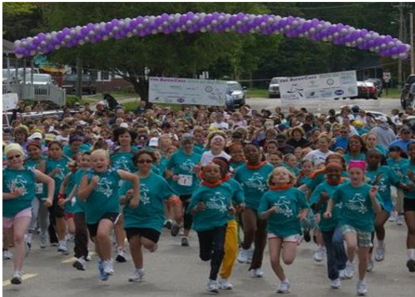
Girls on the Run 5K Celebration Run 2009

The GOTR program is also sponsoring Girls on Track program this year which is available to 6 th , 7 th , and 8 th grade girls. The curriculum is similar to Girls on the Run but the messages more accurately address issues faced during the middle school years.