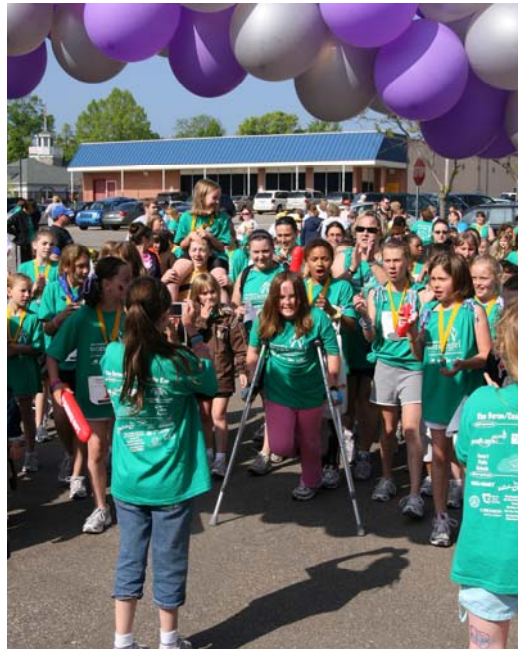
Girls on the Run 5K Celebration Run 2008

The GOTR program is also sponsoring a Girls on Track program this year which is available to 6 th , 7 th , and 8 th grade girls. The curriculum is similar to Girls on the Run but the messages more accurately address issues faced during the middle school years.